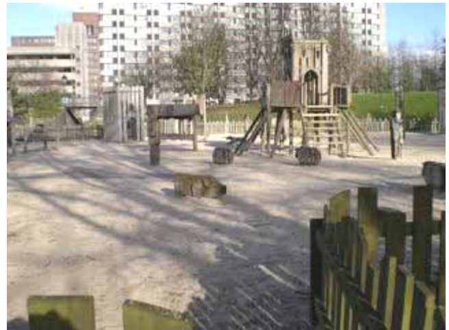
The “hard to find” children’s play area, Castle Park

Is this the best way, for yet another year, to help to prepare the city for another tourist season in a few months time?